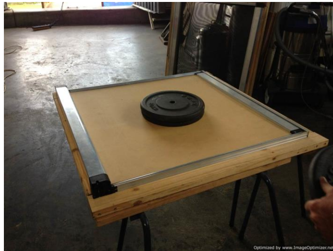
Timber load spreader board with starter weights.

Product Tested: Infinity Zipline Retractable Fly Screen 1 x 1 metre mounted to timber sub frame, 184 x 0.13mm Phifer standard patio mesh.