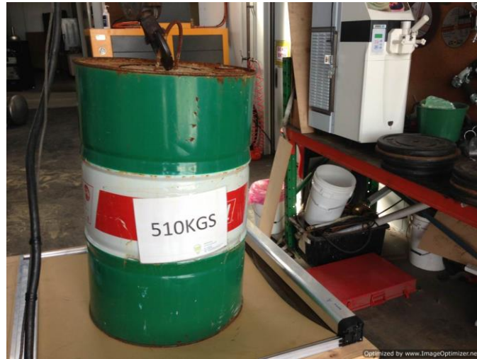
Sample A under test.

AUSTRALIAN NATIONAL TESTING LABORATORIES PTY. LTD.