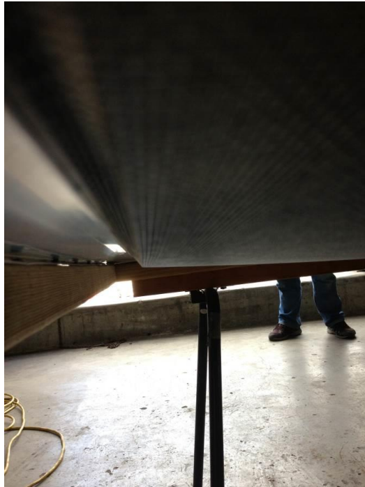
Maximum stretch of material with full load applied of 590kg.

telephone: +61 7 3274 0737 facsimile: +61 7 3274 0712 postal: Po Box 16 Sherwood Qld 4075 address: Unit 17/15 Suscatand St, Rocklea, Qld Australia 4106 web address: www.antl.com.au