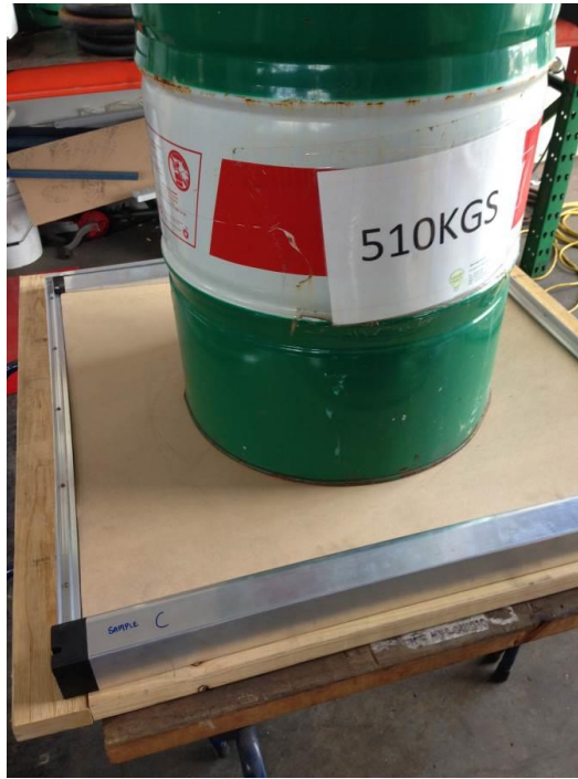
Sample C under test.

AUSTRALIAN NATIONAL TESTING LABORATORIES PTY. LTD.